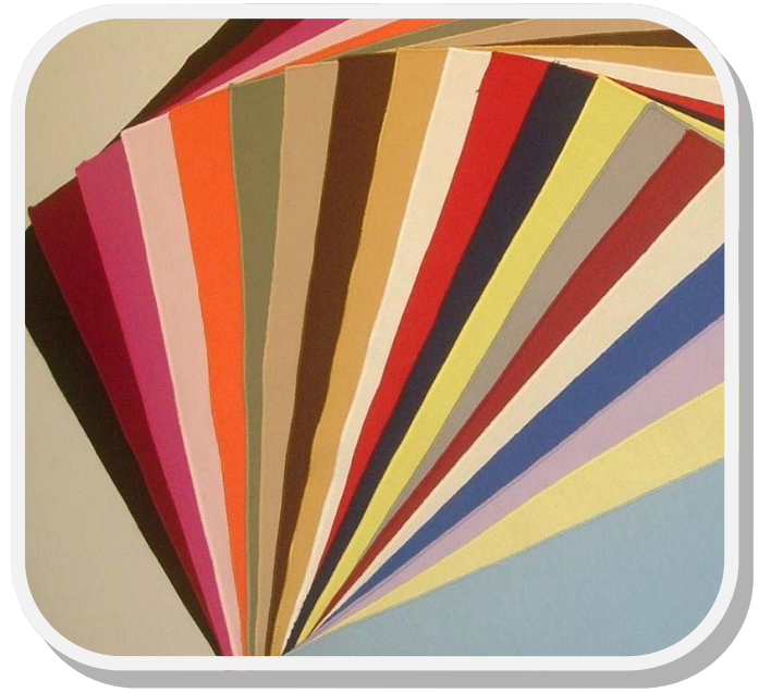
(L to R) Black, Burgundy, Raspberry, Light Pink, Orange, Army Green, Toast, Brown, Gold, Ivory, Red, Navy, Lemon, silver, Brick Red, White, Royal, Lilac, Maize, and Light Blue

NOTE: White, Ivory, and Black Cottonknot tablecloths are available in 96 Rd, 120 Rd, 132 Rd, and 90x156 oversize banquets.