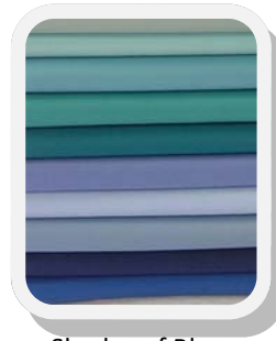
Shades of Blue