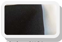
Black and White