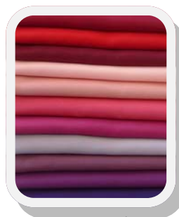
Shades of Red/Purple