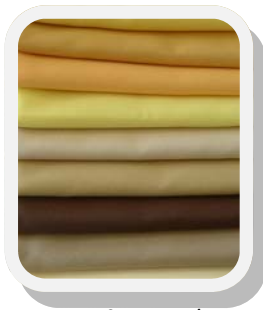
Shades of Yellow/Brown