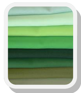
Shades of Green