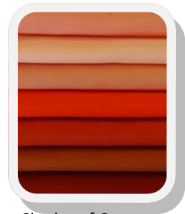
Shades of Orange