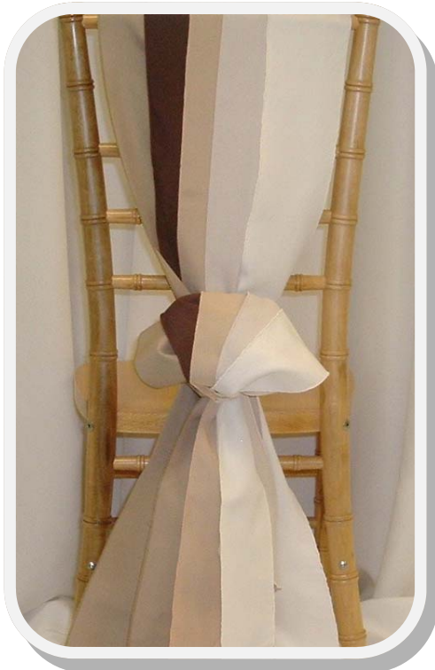
Café, Chocolate Brown, Camel, Tan, Ivory

All poplin polyester colors are a matching accessory to the solid tablecloths available in squares, banquet rectangles, skirts, napkins, and rounds.