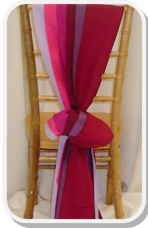
Lilac, Hot Pink, Raspberry, Burgundy, Claret, and Ruby