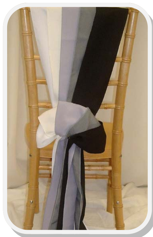
White, Ivory, Silver, Charcoal, and Black