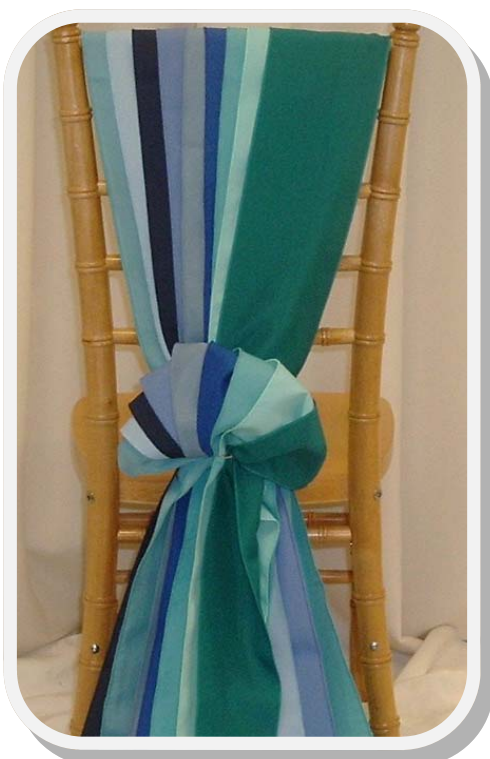
Turquoise, Light Blue, Navy, Periwinkle, Slate Blue, Royal, Jade, Aqua, and Teal