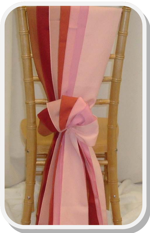
Copper, Terracotta, Peach, Burnt Orange, Coral, Light Pink, and Tigerlily