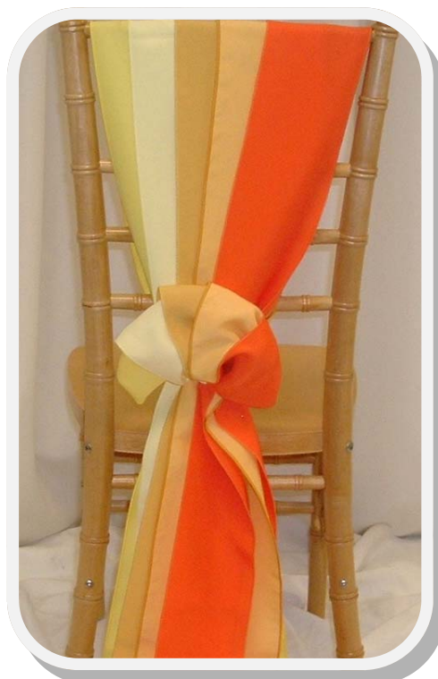
Lemon, Maize, Gold, Goldenrod, and Orange